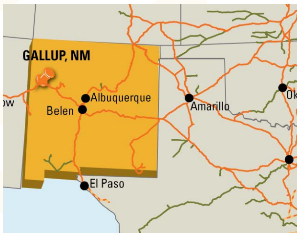
— BNSF railways